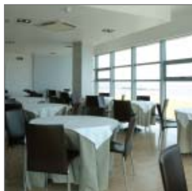
Cassette type unit