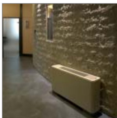
Floor standing unit