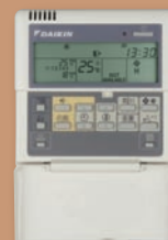
Wired remote control as standard