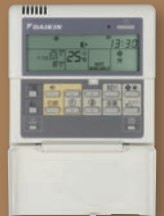
Wired remote control as standard